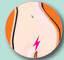
THE LIGHTNING BOLT