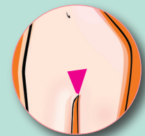
THE BASIC BIKINI