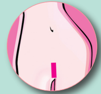
THE LANDING STRIP

Think of this as the bikini bible. This is where you'll find out exactly how to get the style you want, complete with step-by-step instructions and beautiful color photos. It's packed with information and tips that's a must have for any women about to embark on a down there grooming experience. Or become more adventuresome.